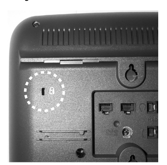
Figure 3-2 Connecting a Cable Lock to the Cisco Unified IP Phone 7931G